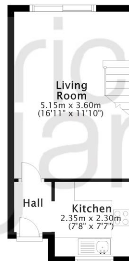
Ground Floor Approx. 26.2 sq. metres (282.1 sq. feet)